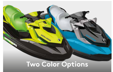
Two Color Options

Both Rotax 1503 engines have been tested and proven to be incredibly reliable while the 1503 NA is the most powerful, naturally aspirated engine on a Sea-Doo®. 1