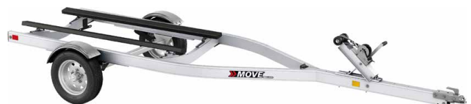
Aluminum MOVE I Extended 1250