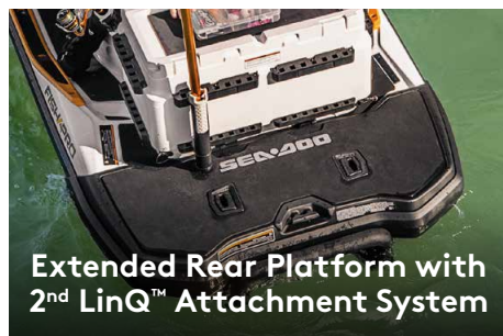
Extended Rear Platform with 2 nd LinQ™ Attachment System

A spacious, quick-attach fishing cooler designed for easy access and equipped with numerous convenient features.