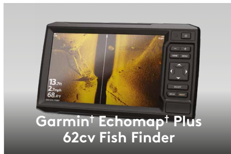
Garmin† Echomap† Plus 62cv Fish Finder

A top-of-the-line navigation, charting and fish-finding system using CHIRP technology for high definition images.