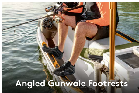
Angled Gunwale Footrests

Adds 11.5 inches to the back of the watercraft to increase stability, space, and storage capability.