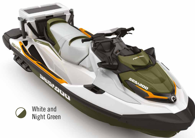
White and Night Green