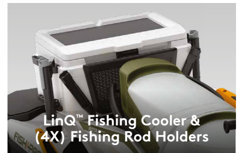
LinQ™ Fishing Cooler & (4X) Fishing Rod Holders

Optimized for ease of movement around the entire watercraft, and for better comfort and stability when facing sideways.