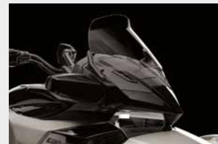
SPORT WINDSHIELD: Provides protection from the wind for improved comfort on the road.