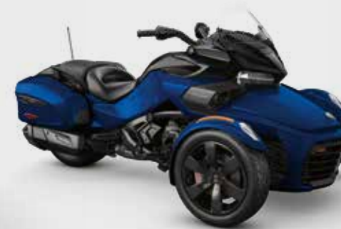
OXFORD BLUE METALLIC