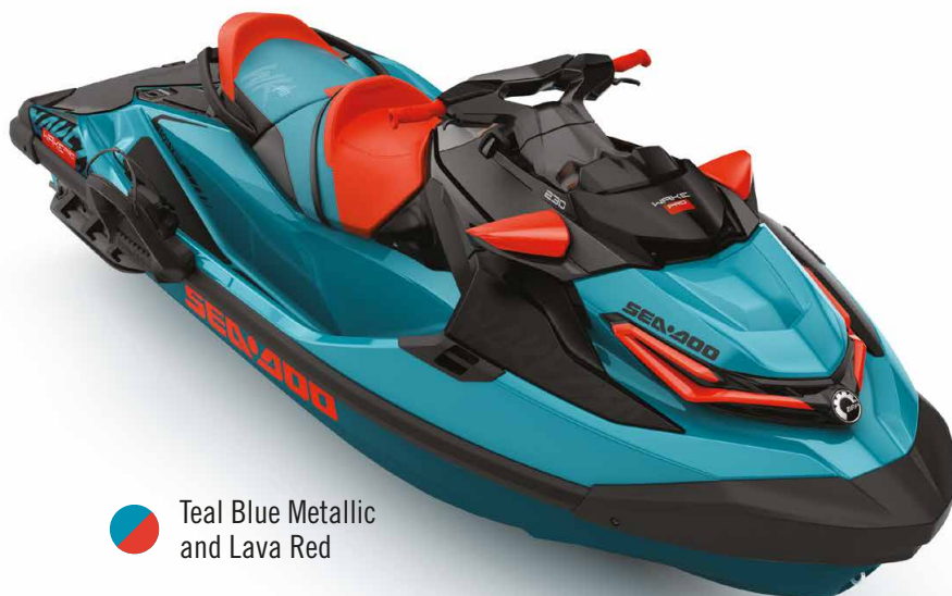
Teal Blue Metallic and Lava Red