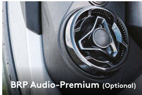
BRP Audio-Premium (Optional)

Exclusive quick-attach system on the largest swim platform in the industry that allows for easy installation of accessories. 1