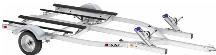
Aluminum MOVE II