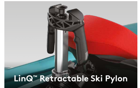
LinQ™ Retractable Ski Pylon

An industry-first manufacturer-installed, truly waterproof, Bluetooth ® audio system. 2