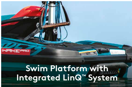
Swim Platform with Integrated LinQ™ System

Exclusive quick-attach system on the largest swim platform in the industry that allows for easy installation of accessories. 1