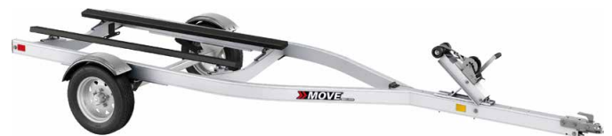
Aluminum MOVE I Extended 1250