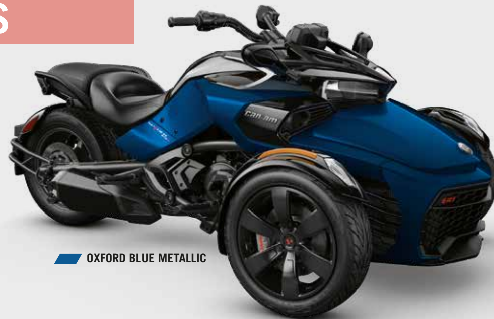
OXFORD BLUE METALLIC