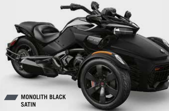
MONOLITH BLACK SATIN